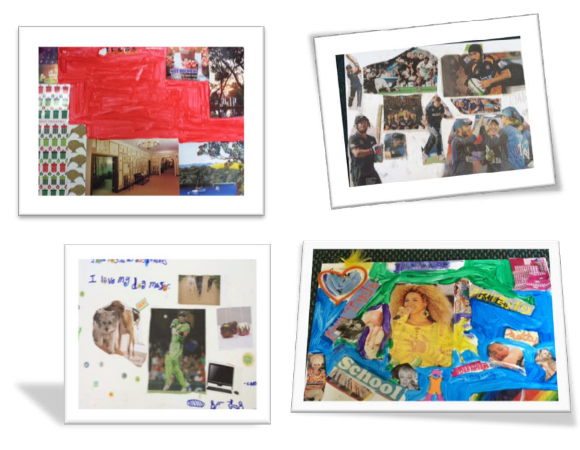
Image 1: Examples of children's collages of informal and everyday learning

The representations of learning that the children chose to collate on their paper do not make sense to an outsider at first glance. It was important to talk with the students to understand what they were representing. For example, two children can use the same representation but have entirely different meanings. Take the picture of a car. For one boy, it was because he was passionate about cars, and wanted to own one when he was older. For another child, the identical picture represented the child's Aunty picking her up in her red car each weekend to take her out of town. It was the trip with Aunty she was trying to represent. A number of boys chose the same picture of modern art, which for them all represented graffiti. For one child he wanted to denote the act of graffiti, but for another boy it was what he learned about 'design'. In a further example, one boy had a picture of a man who was playing cricket. He explained that he liked watching cricket with his father as his father travelled overseas a lot for his job and he did not get much time with him.