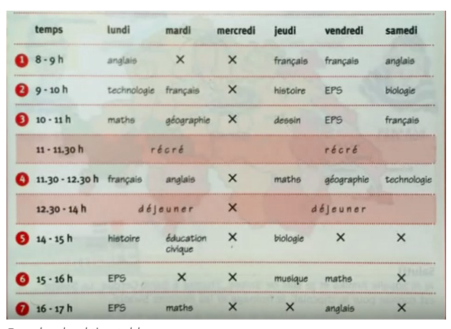
French school timetable

When planning this lesson, Mike had anticipated the students would use subjects from the timetable for their likes and dislikes. However, a number of students became more creative, stating, for example, je n'aime pas lundi (I don't like Monday), j'aime récré (I like break time), and j'aime 15.00h (I like 3.00pm – i.e. when school finishes for the day). Some students also drew on language from previous lessons, and some asked for words they