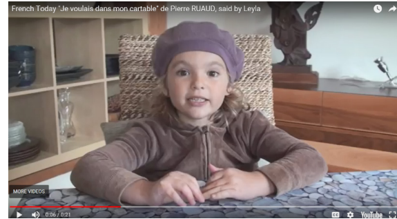
French student reciting a poem

The vocabulary focus of one of the lessons was 'days of the week'. The students were each given a French school timetable (Loescher Editore, 2010, 0.18sec)* and asked to translate it. They were able to quickly work out most of the subjects, and, with some prompting, they also decoded some other words. Mike planned initially to ask the students a series of